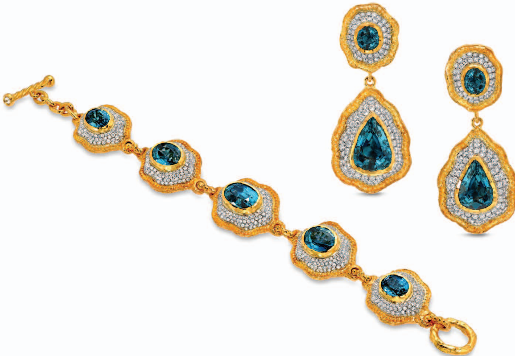
24K & Silver Link Bracelet Cuff with Blue Zircons and Diamonds by Victor Velyan 24K & Silver Earrings with Blue Zircons and Diamonds by Victor Velyan