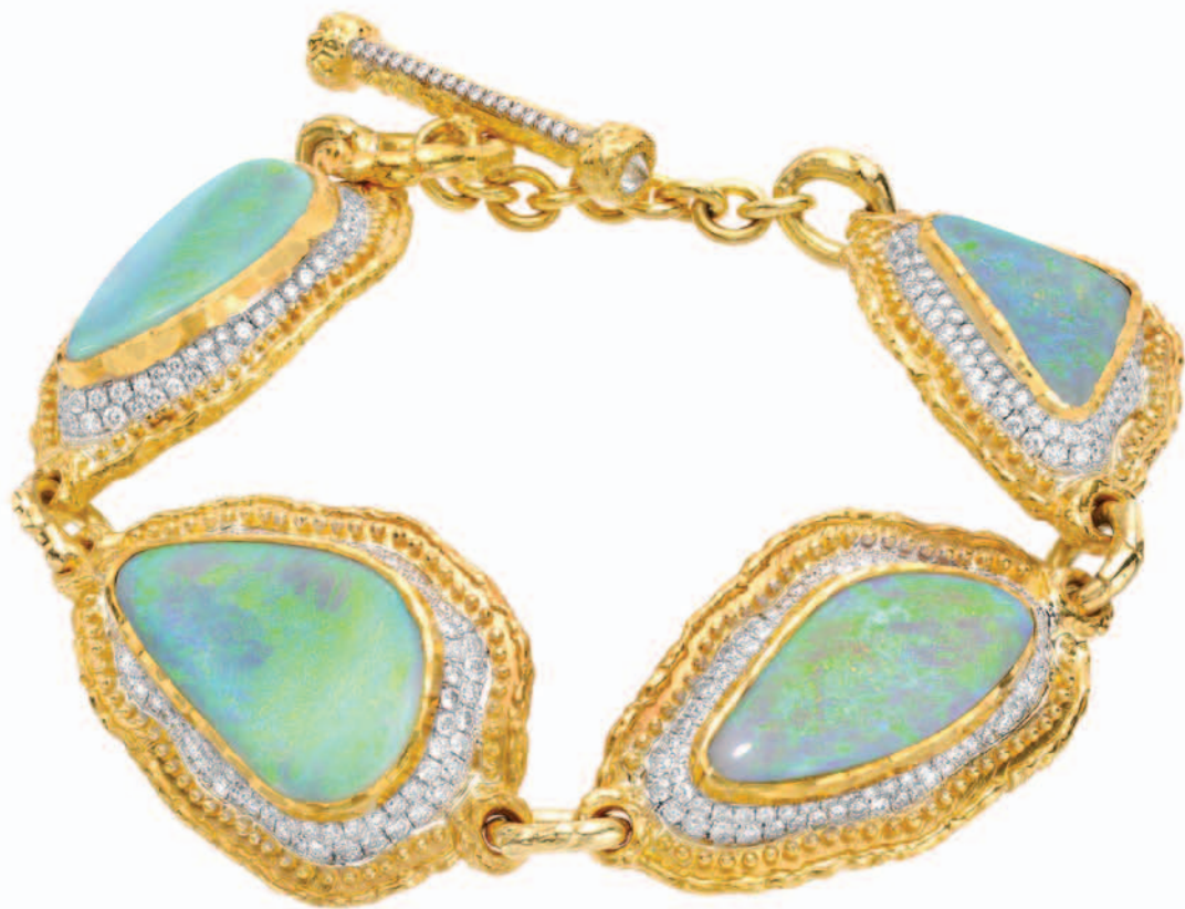
24K & 18K gold Ring with Australian Crystal Opals and Diamonds by Victor Velyan 24K & Silver Link Bracelet with Australian Crystal Opals and Diamonds by Victor Velyan