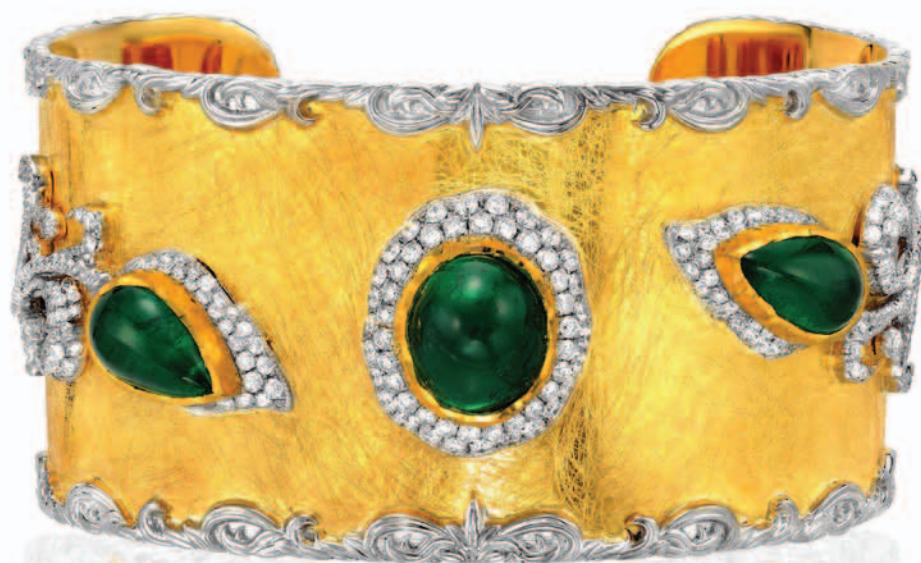
24K & 18K Cuff with Cabochon Emeralds and Diamonds by Victor Velyan 24K & 18K Earrings with Cabochon Emeralds and Diamonds by Victor Velyan 24K & Silver Ring with Cabochon Emeralds and Diamonds by Victor Velyan