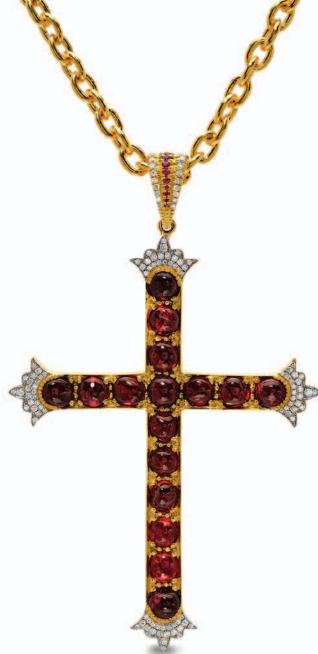
24K gold Earrings with Carved Watermelon Tourmaline by Victor Velyan 22K gold Cross with Spinel, Rubies and Diamonds Victor Velyan