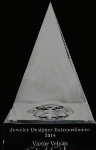
NBAF 2014 Jewelry Designer Extraordinaire