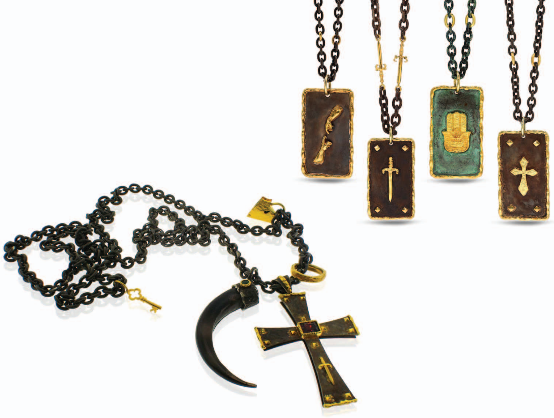
24K & Silver dog tags by Victor Velyan 24K & Silver Cross Necklace with Garnet by Victor Velyan