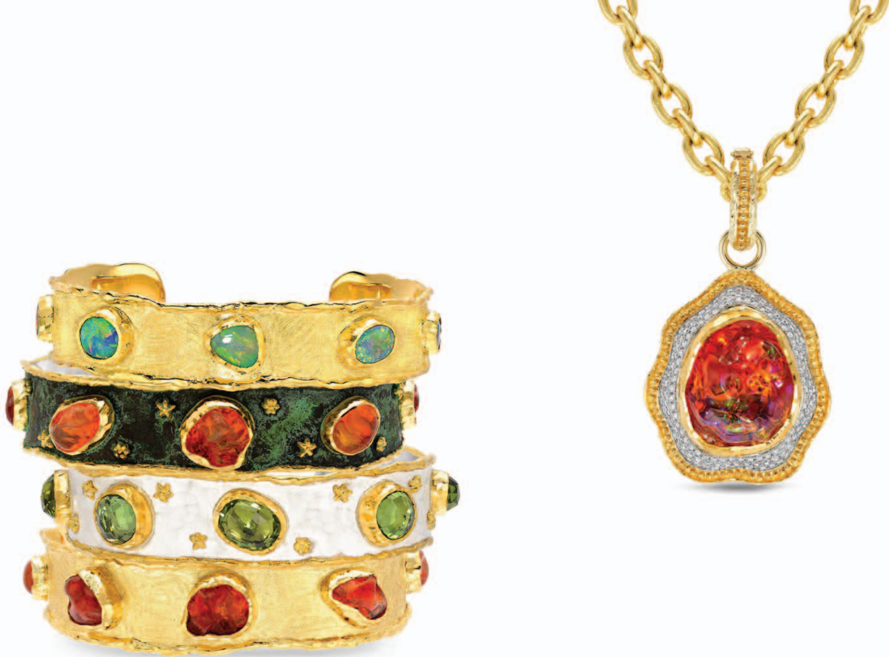
24K gold & Silver Pendant with Mexican Fire Opal and Diamonds by Victor Velyan 24K, Silver & 18Y gold cuffs with Australian Black Opals, Peridots and Fire Opals by Victor Velyan