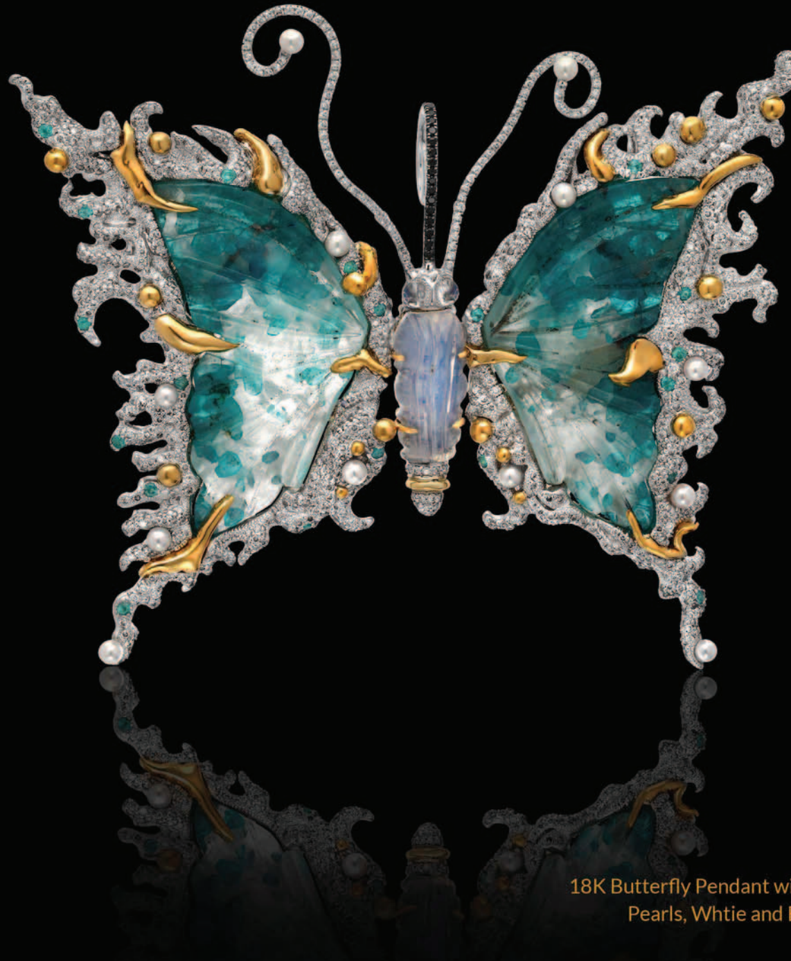
18K Butterfly Pendant with Natural Paraiba, Moonstones, Pearls, White and Black Diamonds by Victor Velyan