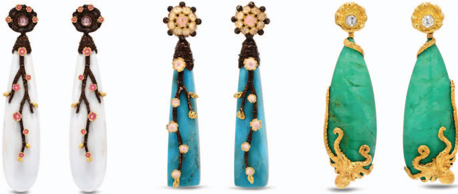
24K Gold & Silver Earrings with Cacholong Opal and Pink Sapphires by Victor Velyan 24K Gold & Silver Earrings with Turquoise by Victor Velyan 24K gold Earrings with Chrysochase and White Sapphires by Victor Velyan