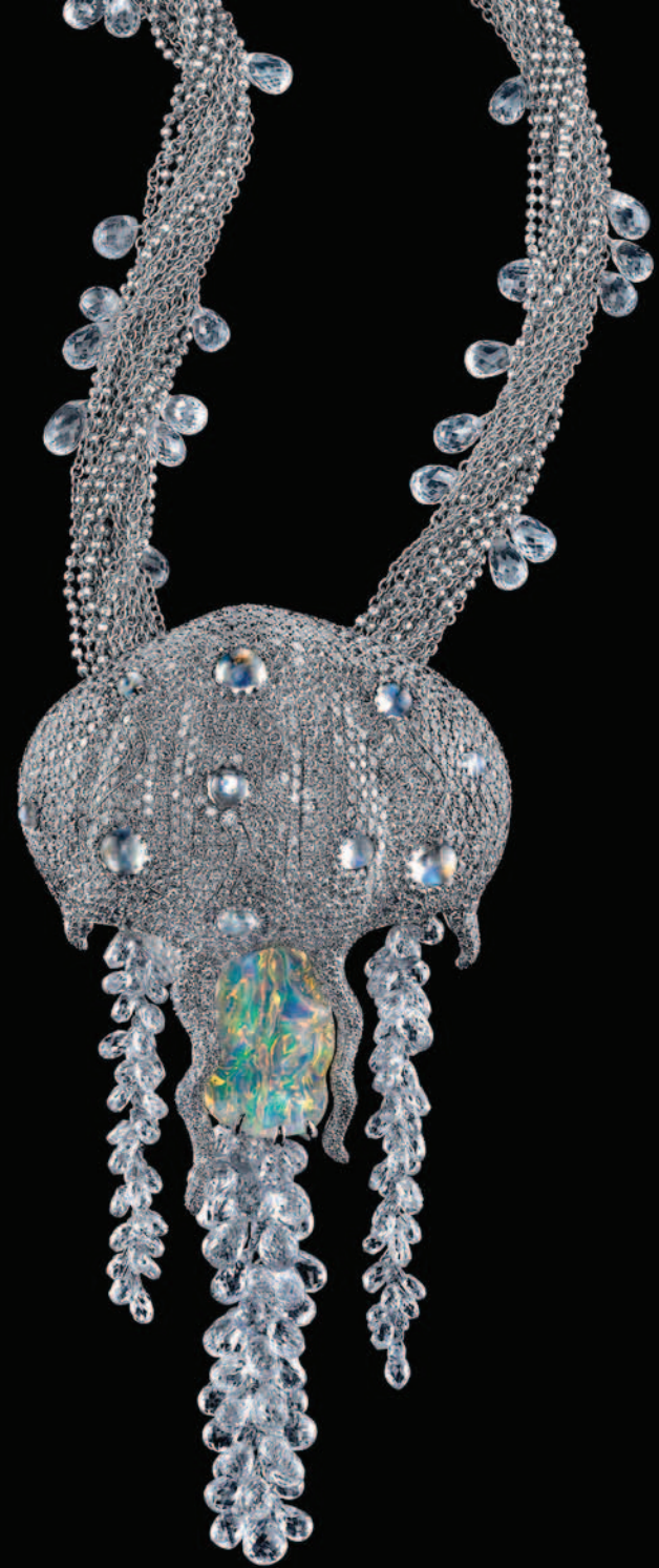
18K Jellyfish Necklace with Mexican Fire Opal, Diamonds, Cabochon Moonstones, Briolette Sapphires and Diamonds